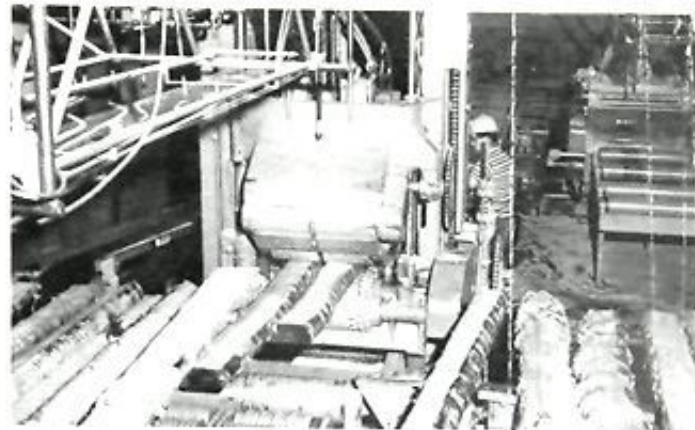
◊ A double-cant gang saw in operation at an automated, high-production sawmill.