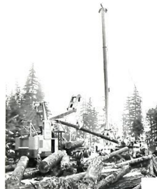
◊ A sprawler heel boom wields logs brought in by a portable metal spar.